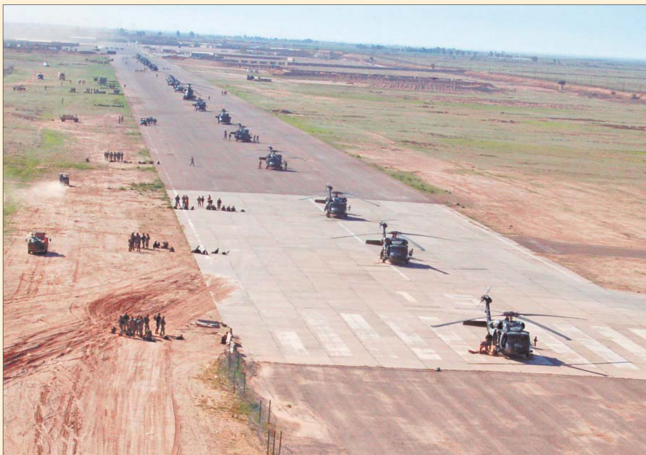
U.S. Army Soldiers, Iraqi soldiers and U.S. aircraft are positioned on the airstrip at Forward Operating Base Remagen, Iraq, in preparation for Operation Swarmer March 16. Operation Swarmer is a combined air assault operation to clear the area northeast of Samarra of suspected insurgents. The Soldiers are from the Iraqi Army's 1st Brigade, 4th Division, and the U.S. Army's 101st Airborne Division's 3rd Brigade Combat Team, and the 101st Combat Aviation Brigade.