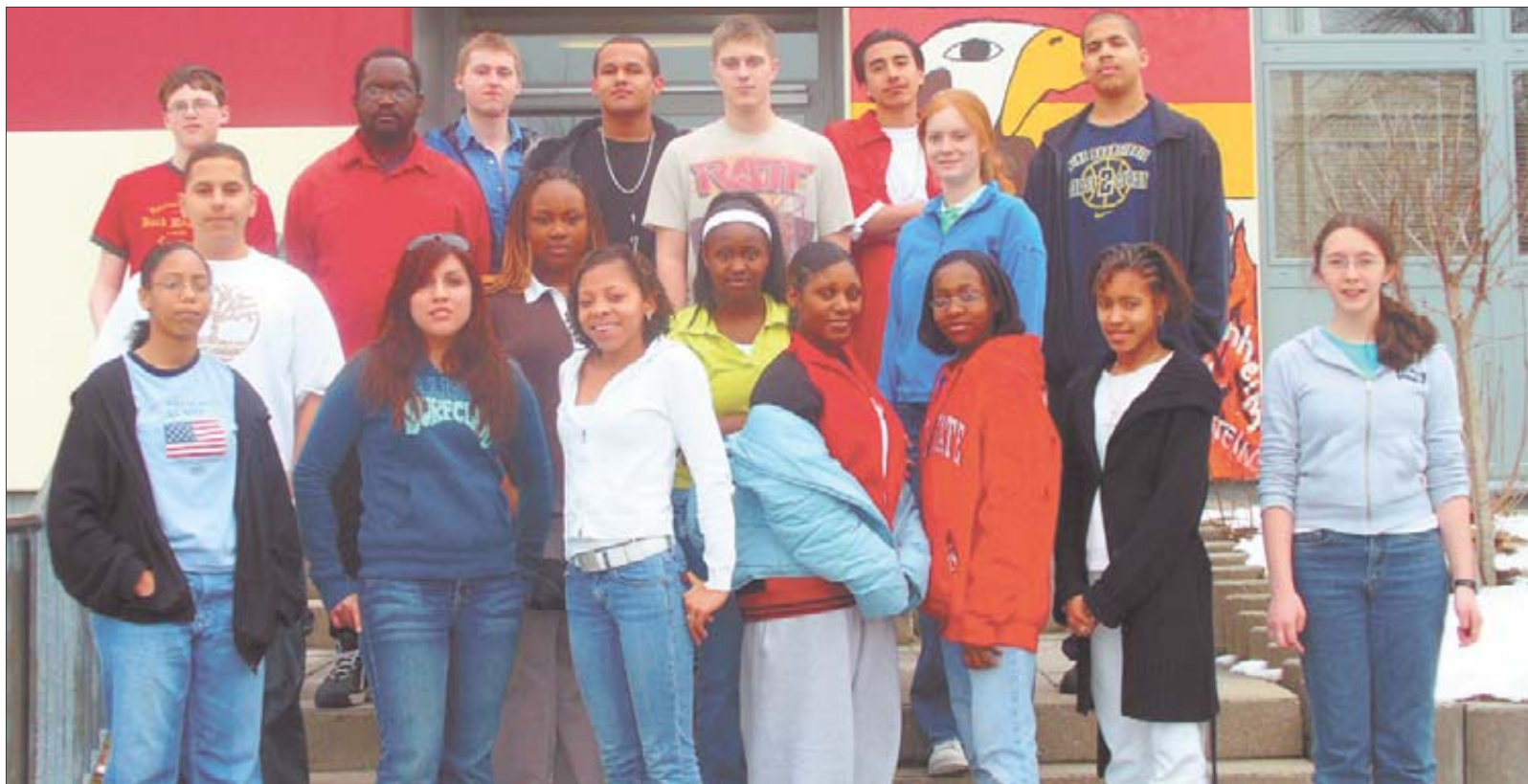
Vilseck Middle/High School students win Vision of Excellence awards at March 3 competition.