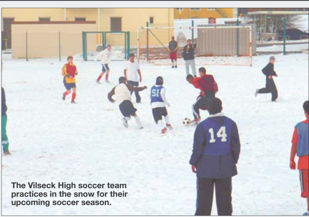
The Vilseck High soccer team practices in the snow for their upcoming soccer season.