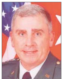
Army Gen. John Abizaid

Iraq needs a unity government, and soon, Abizaid said. The new government must build strong ministries "that are not dominated by various sectarian concerns, and move forward in order to move the country towards peace and prosperity and defeat the insurgency."